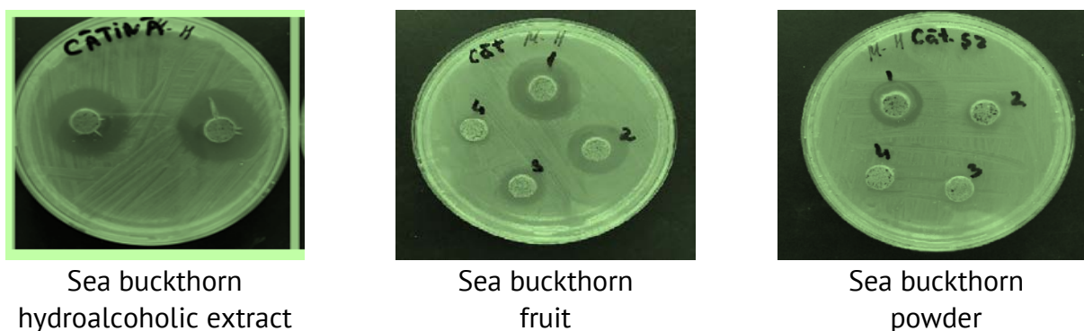
Figure 2. Inhibition Zone for Listeria monocytogenes ATCC 19118 using sea buckthorn. Concentration of test substances: 1 - 250 mg/mL; 2 - 125 mg/mL; 3 - 62.5 mg/mL; 4 - 31.25 mg/mL.

Figure 2 shows the influence of antimicrobial activity of sea buckthorn (hydroalcoholic extract, fruit and powder) at different concentrations of test substances on the growth of Listeria monocytogenes ATCC 19118.