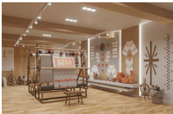
Figure 7. Hall of folk crafts.

The following hall represents the modern society of the century. 19th century, closely related to textile art presenting a wide variety of hand-woven carpets, embroidered towels, garments, pieces and working techniques (Figures 7, 8). Emerging from their character and ethnographic data, the vision of plastic approaches in design was formulated. He opted for games of structure, texture and plastic form, which articulate beautifully with the existing exhibits.