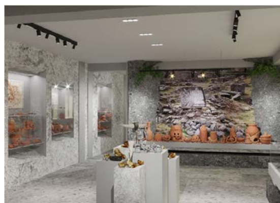
Figure 2. The ancient hall.

Rendering of the interior design by Elena Comarnițchi.