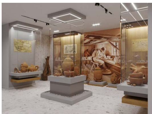
Figure 1. Entrance hall.

The design of the interior space of each room was decided according to different principles and solutions, depending on the pieces or the historical data they present. At the entrance to the Museum, the project proposes a welcoming opening through the entrance hall - arranged in an eclectic manner that combines rustic, classicism and modernism (figure 1). Using a value contrast between the transparent lightness of the glass and the massive pieces of clay, or the strict geometrized and naively modeled forms, the author succeeds in creating a playful game. This game is also animated by the mural that tends to bring back as close as possible the vivid feeling of the historical ambience. The ancient hall was solved in the key of the stone grotto, offering innovative solutions in the modeling of the walls, the floor and the supports of the exhibits (Figure 2). By resorting to the assembly and partial dismantling of the walls, massive niches with a depth of 500 mm were made. In these niches, a sculptural relief associated with the rock invoice specific to the ancient civilization was created. The proposed solution creates an environment typical of the reference historical period and perfectly fits the peasant predilections for pottery and traditional craftsmanship.