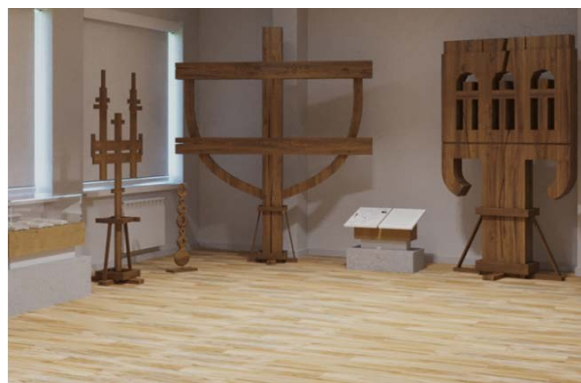
Figure 6. Hall of traditional pieces and utensils.

Rendering of the interior design by Elena Comarnițchi.