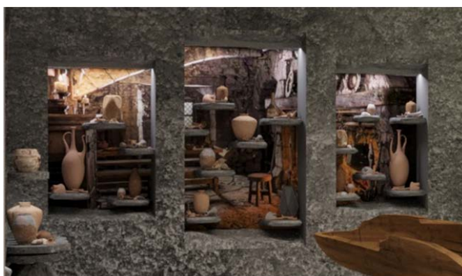
Figure 4. Medieval hall with niches.

Rendering of the interior design by Elena Comarnițchi.