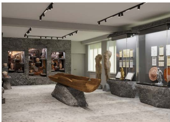
Figure 3. Medieval hall.