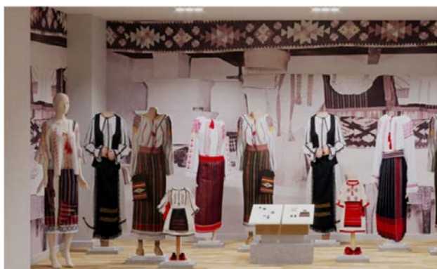
Figure 5. Hall of folk costumes.

Rendering of the interior design by Elena Comarnițchi.