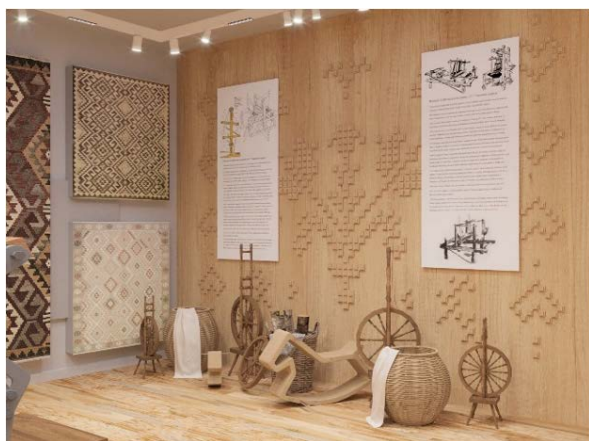
Figure 9. Hall of folk crafts.

The technical and artistic solutions implemented in the interior design project of the Ungheni Museum were coordinated with the design norms in force and existing analogies in this field, taking into account the most relevant buildings known in the country [17].