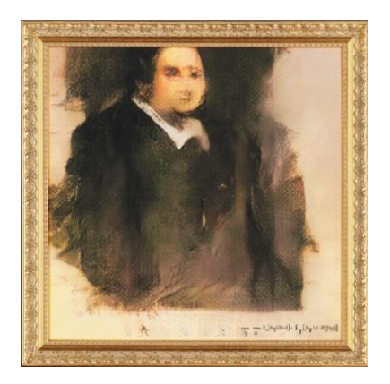
Figure 1. "Portrait of Edmond Bellamy" was generated by team Obvious [4]

Today, digital artists are pairing up with neural networks to create things that can compete with the "old masters" for collectors' money. So, in October 2018, artificial intelligence officially entered the art world: for the first time ever, an auction house sold a painting belonging to the brush of a neural network. "Portrait of Edmond Bellamy"(Fig.1) - the work of Obvious, an art group working under the slogan "Creativity - not just for people" - went under the hammer. Initially, the picture was estimated in the 7-10 thousand dollars, but eventually was sold for 432 thousand dollars [3].