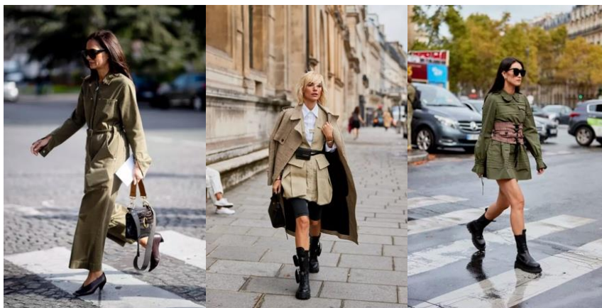
Figure 3: Military styles in spring-summer collections 2020

Dressing in a military style used to be fashionable, but today it is relevant. Green is a mixture of yellow and blue, which is a symbol of confidence. It can be easily combined with office and business clothes. For decorative details, chevrons, shoulder straps, metal rivets, buckles are used. All this only adds to the rigor and perfection of the image. Women are not forbidden to wear berets, which used to be unavoidable. Today, on the streets of the city, you can meet many women in a long military skirt with boots or in high-heeled sandals [3].