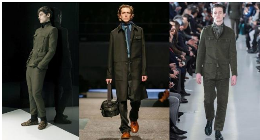
Figure2: Models of men's clothing in military style. Balmain/ Prada/ R. James

A key role in the military is played by functionality and correctly selected shades that harmonize well with vegetation. The basis of the design is the fabric from which the uniforms of that time were sewn. Many brands not only borrow this idea, but also leave many things unchanged.