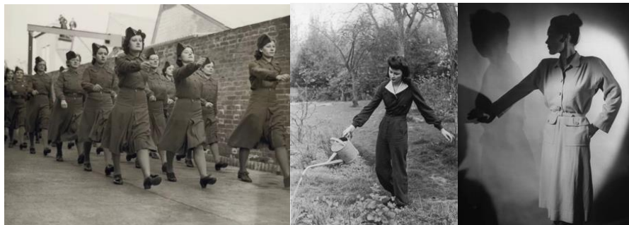
Figure 1: Fashion during the war period. Formation of characteristic features of the military

influenced culture and society. This is how the style of the military arose, which quickly gained great popularity [4]. The peak of its spread in everyday fashion fell in the 1980s, returning to the catwalks and entering everyday life in new interesting interpretations.