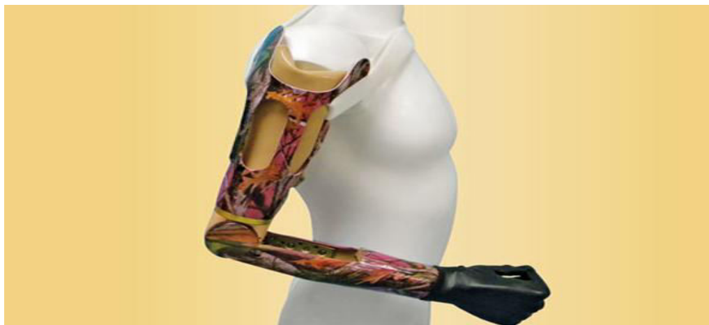
Figure 2. Traction hand prosthesis

However, progress did not stop there. The fact is that traction prostheses have only one strict type of grip; therefore, we can say that traction prostheses are designed for some narrow function, which is not always useful in everyday life [10].