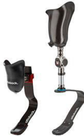
Figure 1. Traction foot prostheses for sport

Traction (or mechanical) prostheses are a frame with many cables (traction). The essence of their work is simple. Special cables are fixed to certain areas of the remaining limb [7]. With the help of force, the cables can be stretched, which leads to bending (or some other) movement of the prosthesis. These prostheses are suitable for any type of amputation, even complete loss of an arm (Fig. 1).