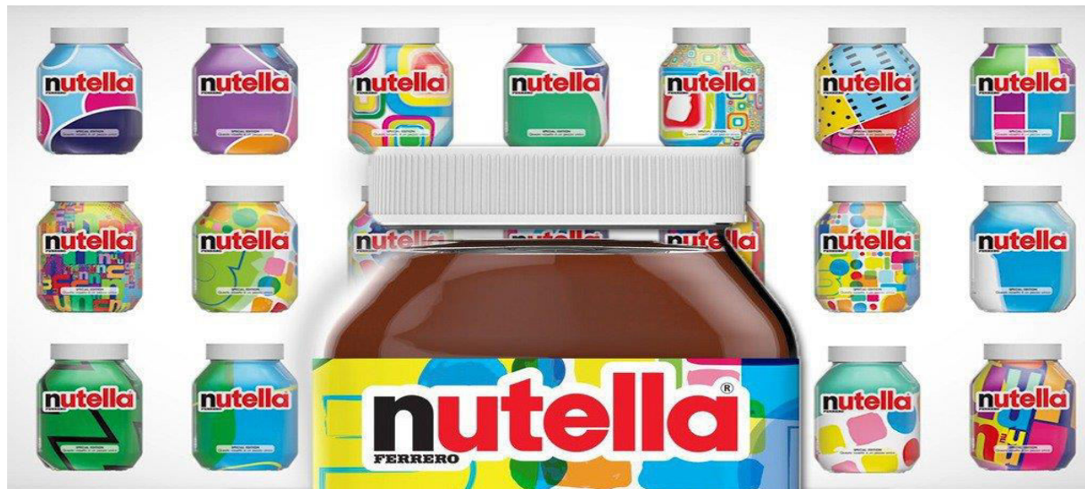
Figure 1. Nutella Unica jars generated by AI

One example like this should not scare graphic designers about job security. Actual situations, the customers remarks, emotions and feelings, questioning and proper answering are things that AI fails to do. This means that it cannot interpret body language or determine how the finished product will impact on the target group.