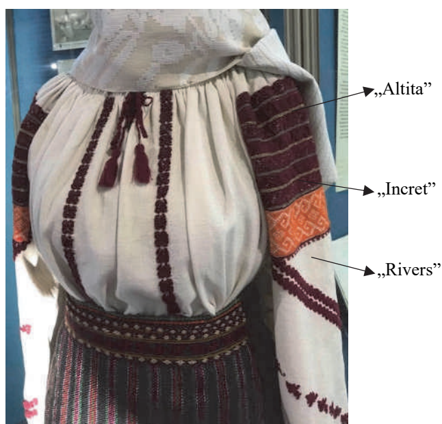
Figure 1. Shirt with "altita", National Museum of Ethnography and Natural History, Chisinau

The rethinking and modification of "altita" were correlated with the requirements imposed on their aesthetic solution. The ornamental motif inscribed on the "altita" – considered sacred – is not repeated anywhere else on the shirt, for example, the "rivers on the sleeve" on the face, or the back of the shirt, are easily repeated" [3, 5, pp. 53-54].