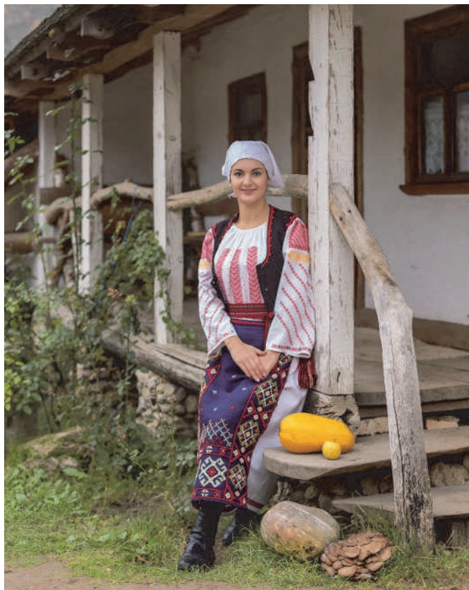
Figure 4. Skirt type “fota” consists of two elements