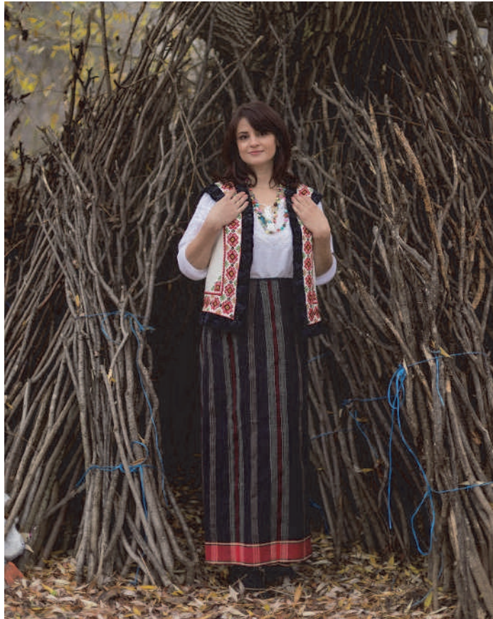
Figure 3. Skirt type “catrinta” consisting of an element