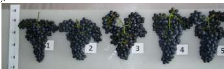
Fig. 2 - The Gobbi Gib 2LG influence on the external appearance of the bunch and berries. Beauty seedless variety, "Terra vitis" Ltd., 2013. The variants of experience: 1-Control-H 2 O; 2-GG2LG -3,6 l/ha; 3- GG2LG -4,6 l/ha, (Italian technology); 4-GG2LG -2,0l/ha; 5- GG2LG-2,4l/ha (Moldova technology)

According to the data reflected in Table 3 it is noted that the grape weight is 251,7 g in the control, but in the 1 st variant (3,6 l/ha) – 404,8 g, with 153,1 g or 60,83% more, and in the 2 nd (4,6 l/ha) – 424,4 g, with 172,7 g or 68,61% more. The 2 nd variant exceeded with 19,6 g the 1 st variant. The bunch is big, conically shaped, and dense. The berries are spherical or slightly oval shape. (Table 3, Figure 2).