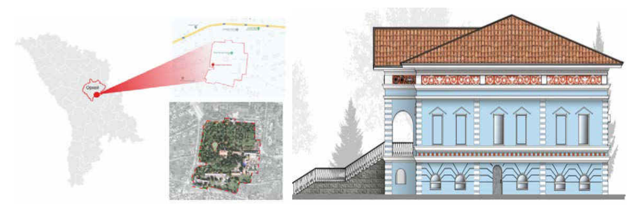
Figure 1. Judi Malec, geographical location of Balioz Manor located in Ivancea village, Orhei district (author Judi Malec).

cedar, and the ginkgo tree, popularly known as the tree of happiness). The main current issue facing the complex is the degradation of both interior and exterior structures, diminishing its appearance and historical value. The park, established in 1880, covers an area of 3.5 hectares and is a doubly protected site, safeguarded by the Laws of the Republic of Moldova [18] (Figure 1).