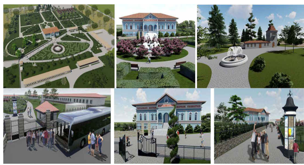
Figure 4. Judi Malec, innovative restoration proposals for Balioz Manor reflected in the project (author Judi Malec).

The central building of the complex is to be revitalized and dedicated to the Balioz Manor Museum, open to the general public with multidimensional support from the National