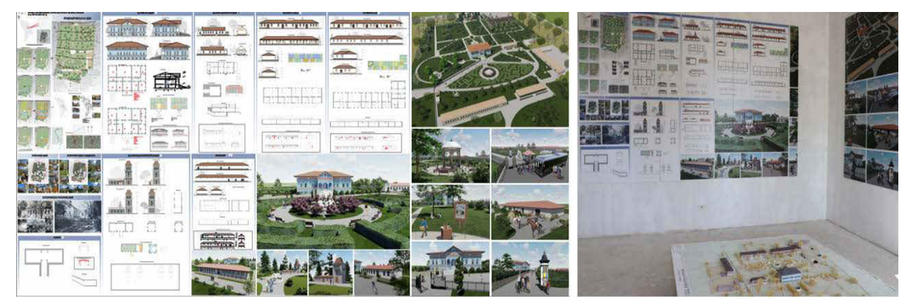
Figure 5. Judi Malec, board and model of the bachelor's thesis project Restoration of Balioz Manor (arrangements in the museum area) (author Judi Malec).

Museum of Ethnography and Natural History in Chişinău in collaboration with the Technical University of Moldova through the Restoration Project-site plans and model (Figure 5). Other spaces will be used as hotel rooms with a conference hall decorated by the fusion of Romanian ethnic style with Ukrainian, while the entrance area will be expanded with a pergola featuring massive columns and two terraces for visitors and guests. Similarly, the project proposes the reuse, renovation, and reorganization of spaces by opening both indoor and outdoor exhibition pavilions to operate regardless of time and season, aimed at involving individuals of all ages in creative activities. Another rehabilitation element, considered necessary by us, is the connection to the national tourist route in the Republic of Moldova.