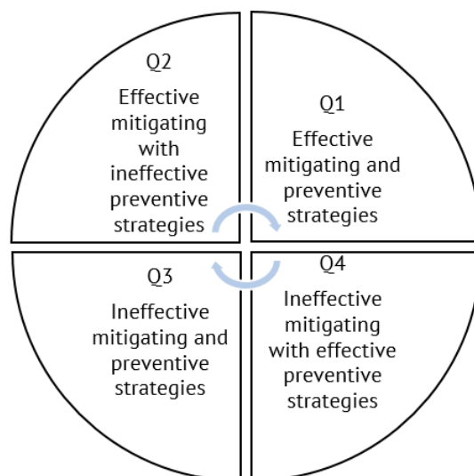
Figure 1. Scenarios to control a pandemic.