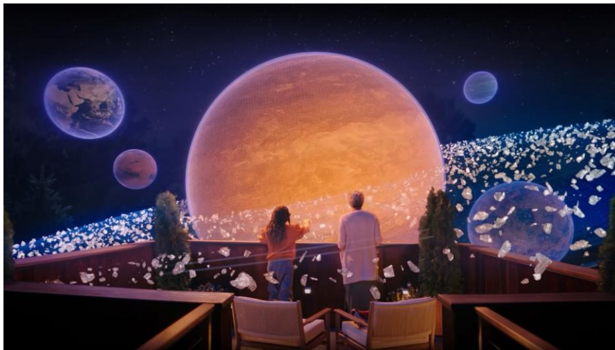
Figure 1. Interacting with planets in the Metaverse

The Metaverse will not just be a classic platform launch, that appears one moment, it is a transition process from the classic internet that will probably take a few years. All we have to do now is implement a set of rules that will protect us from the potential harm that it brings to us, apart from the unlimited opportunities.