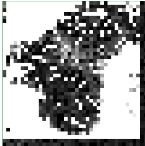
Fig. 2. X-ray imaging result with a lead-object of \text{イ} (Japanese character)