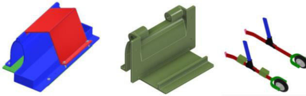
Fig.1 Sketches: a) for the batterie, b) controller and c) position in the walker

Design the electronic board. The electronic board has been designed to accommodate both the current and future components, ensuring scalability. The board's optimized layout allows for seamless integration into the walker, utilizing a low-power ESP32 microcontroller with multiple communication interfaces and a 32-bit processor for real-time sensor data processing (Figure 2). The prototype incorporates various sensors, including IMU, Time of Flight (ToF), and LiDAR, to collect precise data on movement, distance, and environmental mapping. Initial tests have shown high reliability, effectively tracking gait, balance, and walking intent, enabling future integration of AI for enhanced data analysis and user safety.