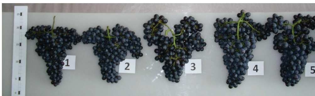
Figure 5. The Gobbi Gib 2LG influence on the external appearance of the bunch and berries. The Beauty seedless variety, “Terra vitis” Ltd., 2013. The variant of experience: 1-Control-H 2 O; 2-GG2LG -3.6 l/ha; 3-GG2LG-4.6 l/ha, (Italian technology); 4-GG2LG-2.0 l/ha; 5-GG2LG-2.4 l/ha (Moldova technology)

Thus, it can be said that the use of Gobbi Gib 2LG, leads as to an increase of cluster productivity up to 1.6-1.7 (Italian technology) and to 1.8-2.0 times (Moldova technology) indifferent the ways of applications and concentration as well as to the quality production modification. Data analysis gives us a reason to recommend the use of the Gobbi Gib 2LG within seedless variety as an obligatory process within their harvest in the Republic of Moldova.