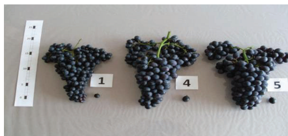
Figure 3. The Gobbi Gib 2LG influence on the external appearance of the bunch and berries. The Beauty seedless variety, „Terra vitis” Ltd., 2013, (Moldova technology). The variant of experience: 1-Control - H 2 O; 4-GG2LG - 2.0 l/ha; 5- GG2LG - 2.4 l/ha

Inside the grains there was a inconsiderable fell down of the composition of the dry matter (sugar), and the titratable acidity rate was not higher than that of the control.