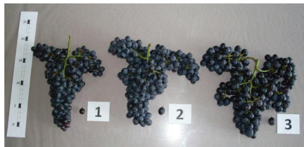
Figure 1. The Gobbi Gib 2LG influence on the external appearance of the bunch and berries. The Beauty seedless variety, (Italian technology). The variant of experience: 1-Control - H 2 O; 2-GG2LG -3.6 l/ha; 3-GG2LG-4.6 l/ha

The quantity of berries is equal to the control. At the same time the grain characteristic value increases and so the weight of a 100 grains increases up to 1.5 (GG2LG-3.6 l/ha) - 1.7 (GG2LG-4.6 l/ha). Within these terms the harvest data increases up to 2.3-2.6 kg/vine. The sugar content is at the same level as that of the control, or may even be a little higher but it is to be mentioned that decreases the level of the titratable acidity (Table 1, Figures 1, 2).