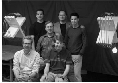
Inventors group ( Marin Soljačić – center) and their functional pilot device: left – transmitter , right – receptor and the working lamp.

(Fig. 2a). Yet scientists noted huge energy losses, because only 40% of it reaches the receptor. But the specialists work on that problem, and there is a significant chance that in the near future, the energy losses will be reduced to minimum.