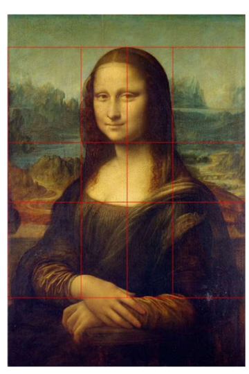
Figure 3: Golden Ratio in Mona Lisa [5]