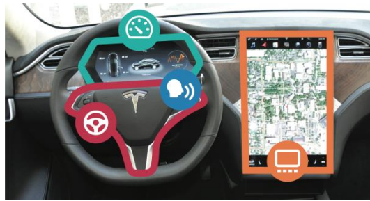
Figure 1. Tesla Model S interior (17" center display and a 12.3" gauge cluster display, voice controls and steering wheel buttons) [1]

some intersections, thus generating a potentially high-risk situation that could lead to a crash and according to European Road Safety Observatory [3], distracted driving is the cause of between 5% to 25% of the road crashes.