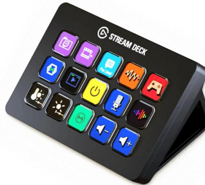
Figure 2. Elgato Stream Deck (example of a device with customizable tactile buttons) [10]

Tactile buttons with small screens behind them already exist, for example as stream decks (Fig. 2).