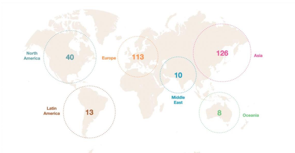
Figure 2. Global distribution map of Hermès stores [4]

The brand sells its products using an omnichannel distribution strategy. It is prevalent in around 45 important countries around the world. It has also expanded its e-commerce platform for selling its products. These platforms, which are already present in 28 countries, are constantly growing [9].