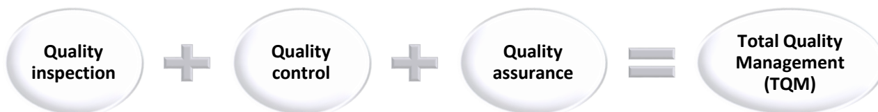
Figure 2. The elements of Total Quality Management (TQM)

After the 1980s, Total Quality Management (TQM) was widely accepted in both public and private organizations. This concept was proposed by Joseph Juran and led to the development of ISO standards (International Organization for Standardization), which are still used today for continuous quality improvement.