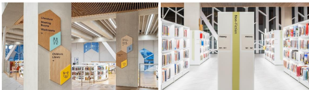
Figure 3: Calgary Central Library [11]