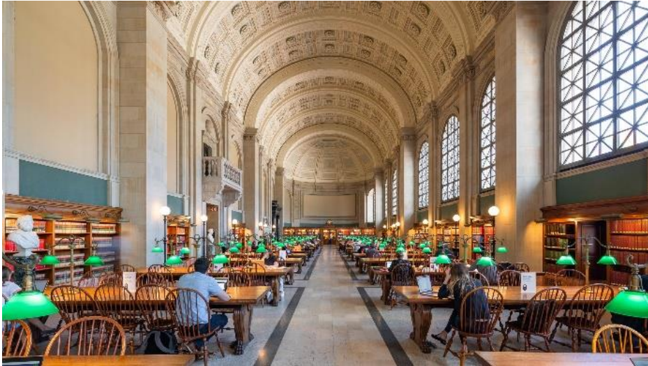
Figure 4: Boston Public Library [12]