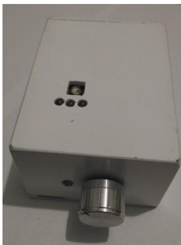
Figure 2. Device for studying skin reaction to light

It features three light sources: an UV source with a wave length of 390 nm, and another UV source with wave length of 402 nm, a white LED and RGB LED . The user can choose the desired source and light intensity. RGB LED can be set to the desired lighting, user can independently adjust each color for red, green and blue. Photo of the device is shown below(Fig.2).