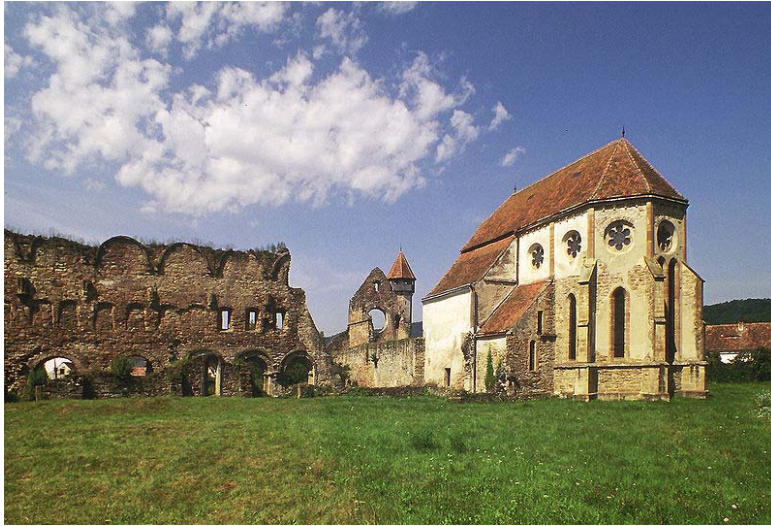
Carta Monastery founded in 1202.

The network of Cistercian monasteries (one of them is situated in Carta village, 80 km from Brasov) played a main role. They were places of technological innovation,