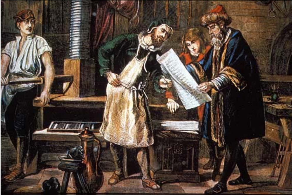
Gutenberg Printing Press.

The invention of moveable-type printing by Gutenberg, in the middle of the fifteenth century, was a technical innovation with unprecedented impact. It allowed,