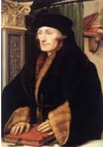
Erasmus of Rotterdam 1466 – 1536.